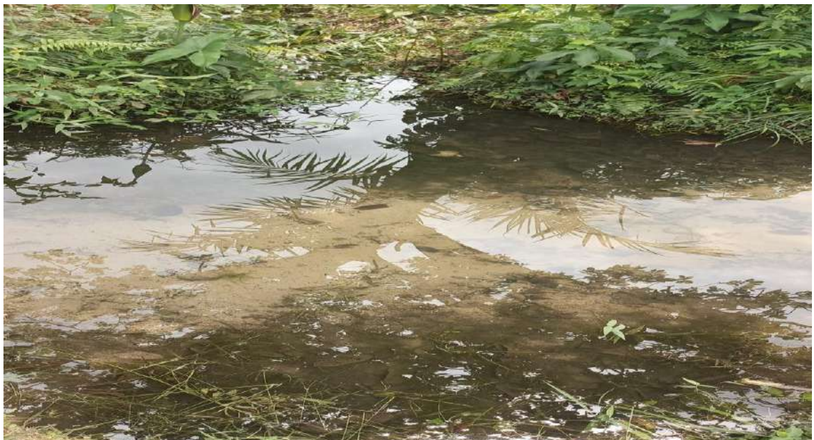
Picture Showing Stream water that served as source of water for domestic and drinking. https://photos.app.goo.gl/5KhCq7GNtB1t54v88