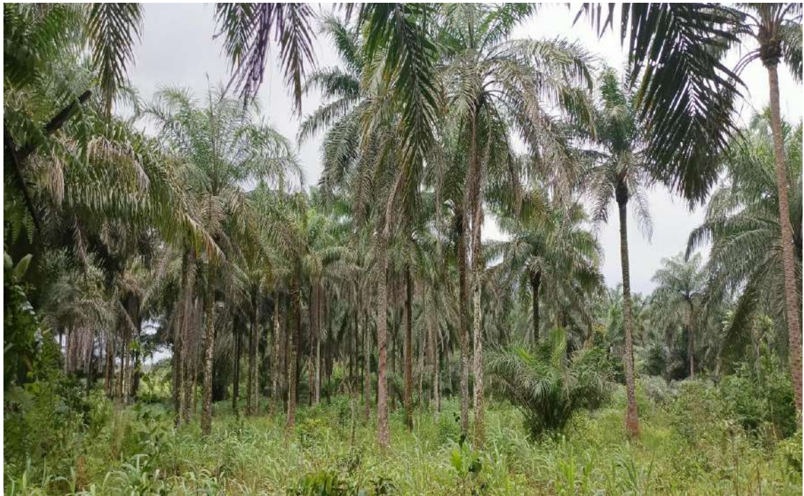
Picture Showing Palm Plantation that is not Fruiting Due to Climate Change in Kono